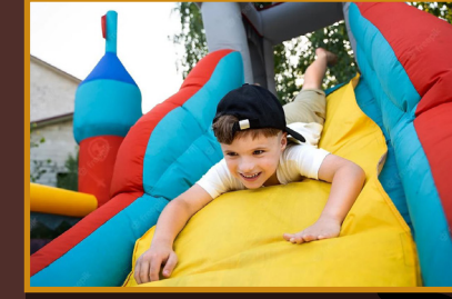
Kids Day 10 a.m. - 3 p.m.