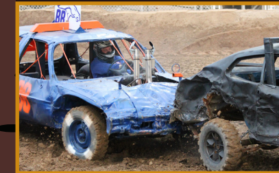
Demo Derby - 7 p.m. Presented by JFW Trucking

Adults (13 & up): $20. Children (3-12): $10. Children under 2 are free with paying adult.