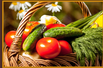
Senior Day - 10 a.m. - 3 p.m.