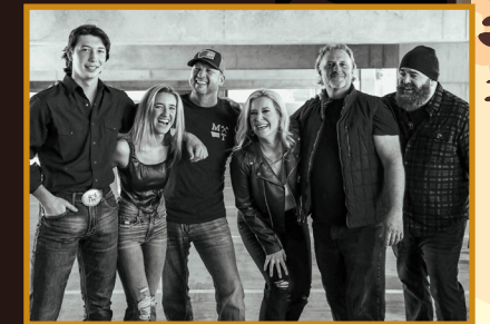
Copper Mountain Band 6:30 p.m.