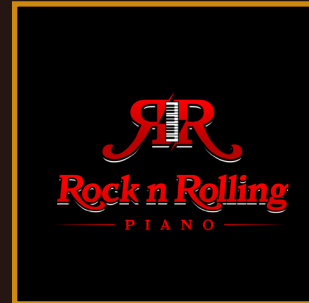
Rock n Rolling Piano All five days