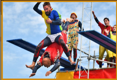
High Dive - All five days