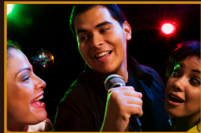
Live music & karaoke All five days