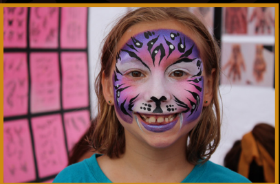
Día de La Familia Presented by Amazon $2 rides - All day