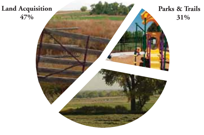
Conservation Easements 22%

$110,268 has been available for many small projects such as environmental education, historic preservation, park improvements and planning projects.