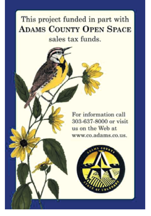
This sign is displayed on project locations funded with Adams County Open Space Sales Tax dollars.