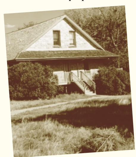
The Rocky Mountain Bird Observatory Stone House at Barr Lake State Park

dams County citizens passed an Open Space Sales Tax on November 2, 1999. The voter-approved issue called for 68 percent of the proceeds from the tax to be distributed to eligible jurisdictions by a grant process. The Open Space Sales Tax issue also provided for 30 percent of the funds to be returned to the cities and county based on where the tax is collected. The remaining 2 percent may be used for administrative purposes.