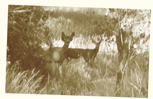
South Platte Wildlife Corridor

Funds are allocated to improvements at Ruston Park.