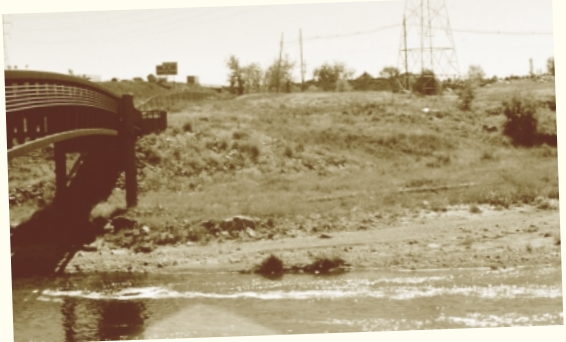
Sand Creek Regional Greenway Trail, Commerce City

Adams County, South Platte Wildlife Corridor $600,000 Purchase fee simple or purchase conservation easements along the South Platte River from Hwy. 7 to 104th Avenue for preservation of approximately 192 acres. This property will be conserved as a wildlife corridor.