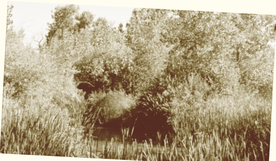
Open Space at the Regional Park