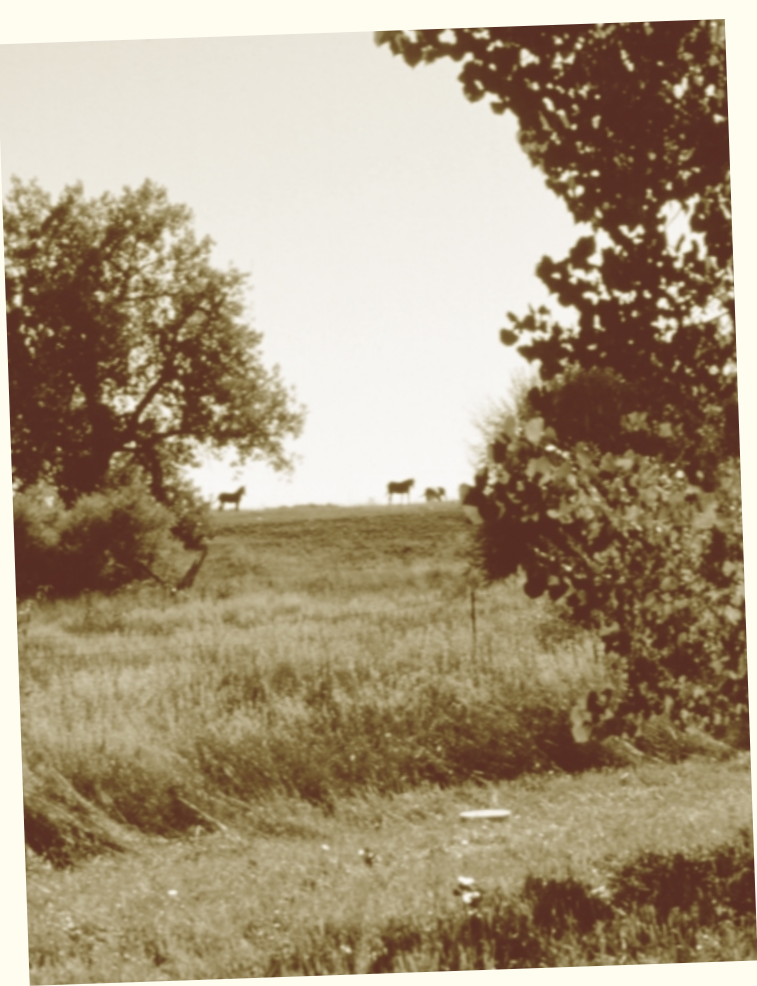
Sand Creek Greenway, Aurora

Following are the grants the Adams County Open Space Advisory Board recommended for funding with sales tax revenues collected in 2001. The Board of County Commissioners approved the recommendations and awarded the grants.